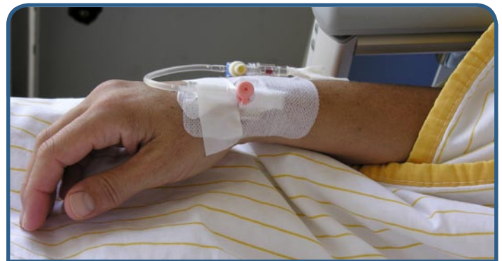
One less worry if critical illness strikes

Permanent disability would also trigger a claim. Again, each