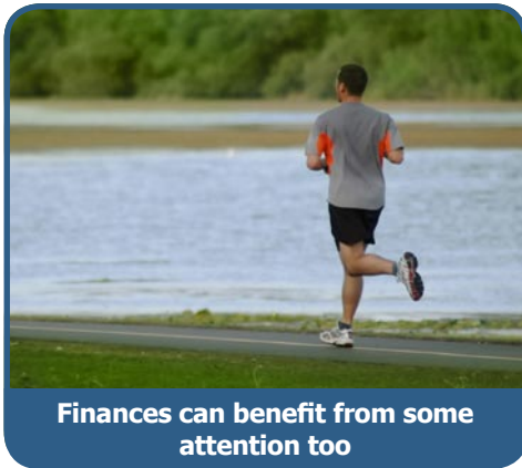
Finances can benefit from some attention too