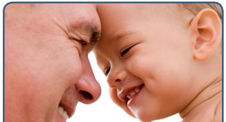
Start young with a Junior ISA

As with any equity-based investment, the stocks & shares Junior ISA is the riskier option - you might end up with less than you put in. But the potential returns are higher than for a savings account.