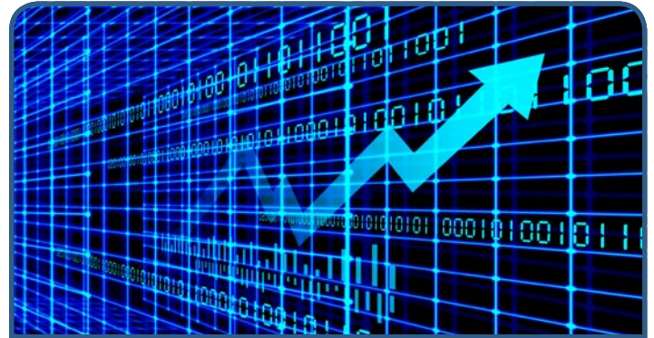
An attractive potential return

While some people wish to retire as soon as possible, others feel that they will be able to work well beyond even the increased state retirement age (which will reach 66 for both men and women by April 2020). Between April 2034 and April 2036, the state retirement age increases to 67, affecting anyone currently