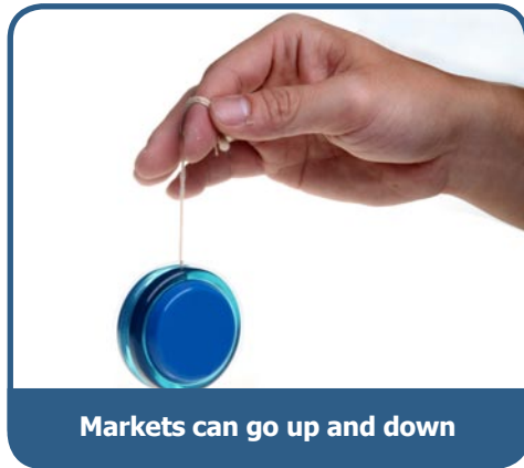
Markets can go up and down

During the past six months or so, we have seen stockmarkets swing significantly, with the FTSE100 soaring as high as 6,103.7 (3rd May 2011) and falling as low as 4,791 (9th August 2011).