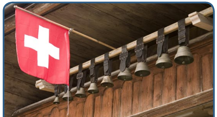
No longer possible to forget to declare overseas income?

In order to avoid 'hot' money being moved to alternative banking tax havens, the Swiss banks have agreed to tell HMRC should their customers try to move money to avoid being caught.