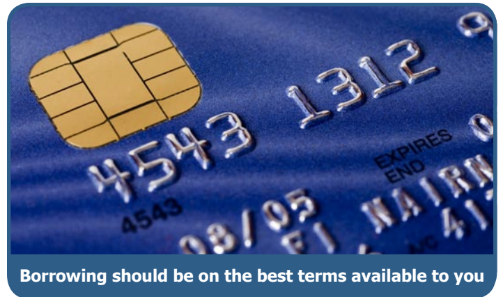
Borrowing should be on the best terms available to you

Every so often, you may receive a letter from your bank offering you the opportunity to switch debt from 'expensive store cards' to your usual credit card with them. But is this always a good idea?