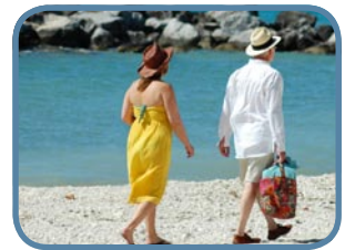
Will the pension changes affect you?