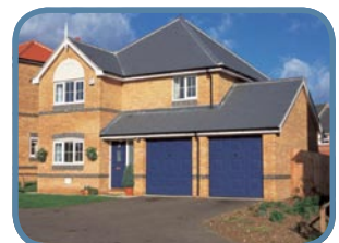
Mortgage advice is important