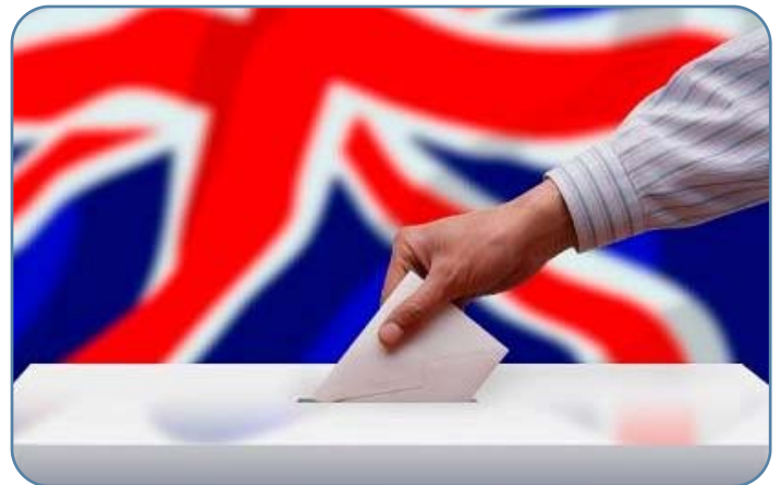
After the election comes the pain of paying for so much borrowing

Responsibility to say whether he is achieving his targets or not.