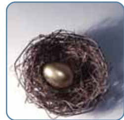
Increased ISA limits