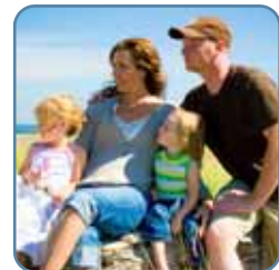
Family income benefit