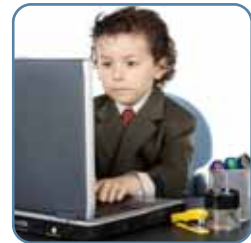
Helping future generations