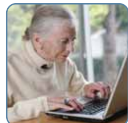
Working later in life?