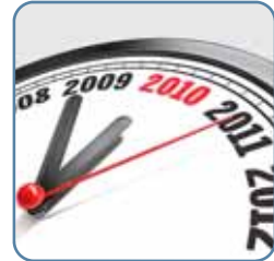
Happy New Year