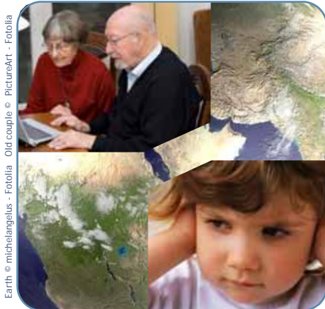
Earth Old couple

A neutral budget was not only to be expected but may even be welcomed; few headline-grabbing, but meaningless, initiatives.