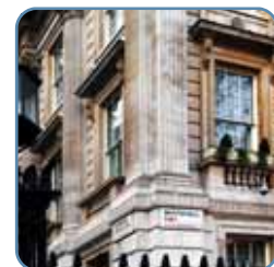
Back page briefing