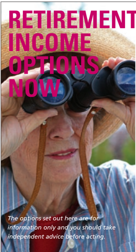
The options set out here are for information only and you should take independent advice before acting.

Virtually all pension providers have radically revised their pension offerings to take account of these investment revisions and the many other changes introduced on A-day. The new generation of self-invested pensions offers you a very wide investment choice, with much greater scope for contributions than was possible under the old rules.